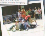
團體活動 Group Recreation Activities