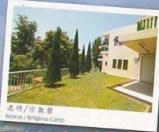
退修/宗教營 Retreat / Religious Camp